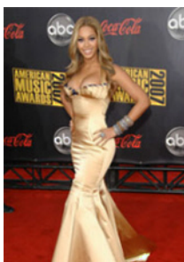
Photo: Beyonce can be seen on the red carpet, wearing matching gold minx nails with her gold designer dress.

There are lots of designs and colours to choose from!